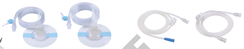
Disposable negative drainage suction cup (five-cavity & seven cavity)

Side suction cup technology (S.O. M.T NPWT) is composed of a unique side suction multi-cavity negative pressure drainage suction cup developed by TIANPU Medical Technology Co., Ltd. combined with Intelligent Negative Pressure Wound Therapy Device monitors and adjusts the negative pressure at the wound site to ensure that the best therapeutic effect is maintained.